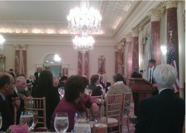
Kurt Campbell, Assistant Secretary of State for East Asian and Pacific Affairs, speaks at the Asia Society Global Forum

Asia Society Korea Center participated in the 2010 Asia Society Global Forum, which was organized to bring together members of Asia Society boards and Global Council and Fellows to meet with U.S. government representatives to explore together how to strengthen and better focus our global organization. The Forum was held in Washington D.C. from June 8 to 10, 2010, and it especially dealt with issues and agendas relating to Asia-U.S. Relations and how Asia Society can respond to these as they undergo change. There were